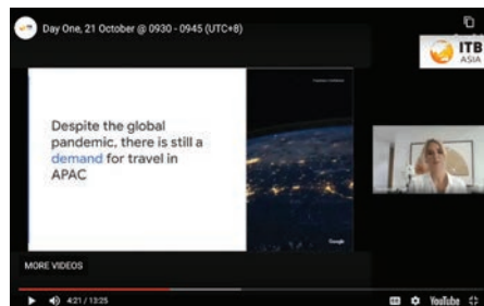
Joye: greater preference for bookings with OTA

Speaking at a keynote session at ITB Asia 2020 Virtual yesterday, Joye stressed the importance for companies to improve their digital presence, as the modern traveller is