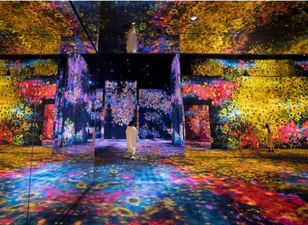
teamLab/Valley of Flowers and People: Lost, Immersed and Reborn, 2020. Interactive/Digital Installation, Endless.

With family travel on the rise, more attractions are crafting activities suitable for bonding with the brood. TTG Show Daily rounds up five fabulous vacation ideas across Asia for the next multigenerational getaway. By S Puvaneswary