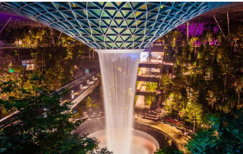
From top: teamLab SuperNature Macao's Valley of Flowers and People: Lost, Immersed and Reborn, 2020; HSBC Rain Vortex at night, Jewel Changi Airport, Singapore