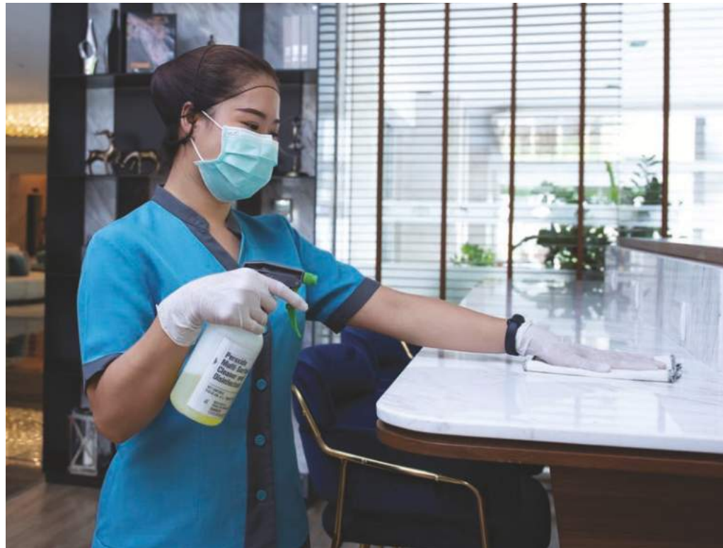
ONYX Hospitality Group ensures cleanliness and warm service touchpoints can co-exist