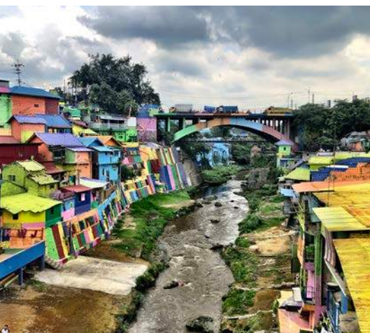
Clockwise from top: Kampung Warna Warni, Indonesia; Mahanakhon SkyWalk, Thailand; Alma Resort Cam Ranh, Vietnam; Angkor Thom, Cambodia